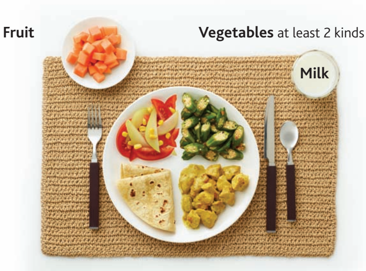
Grains and starches potato, pasta, rice, roti, plantain

Meat and alternatives fish, lean meat, chicken, beans, lentils